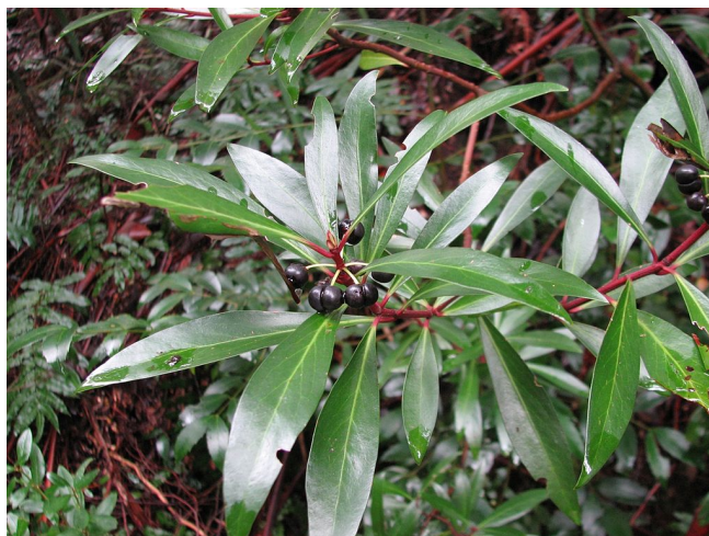
Tasmannia lanceolata , Mount Donna Buang, Victoria, Australia

The Mountain Pepper is a well-known plant species native to Australia. It is distributed from Tasmania to Victoria and Southern New South Wales, having been extensively used by Aboriginal people for its food and medicinal properties. During colonial times, the plant was promptly identified as an efficient source of vitamin C, used to treat scurvy, and was a popular spice for cooking. Today, Mountain Pepper has commercial use, being imported to Japan for constituting one of the ingredients that makes wasabi. The figure below shows a short section of the Angiosperm clade, which includes the order to which Mountain Peppers belong.